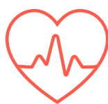
High blood pressure